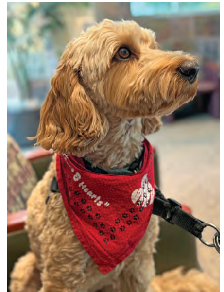
Wednesday – "Thor"