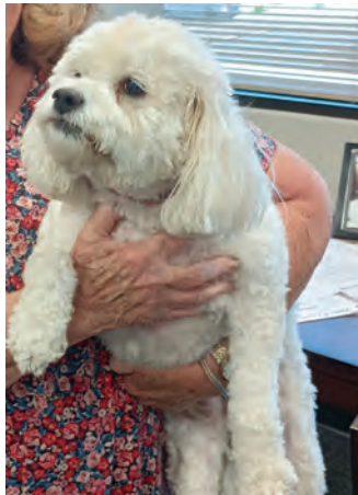
Friday – "Muffin"