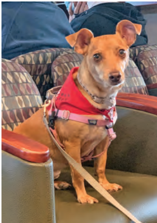
Thursday – "Ernie Banks"